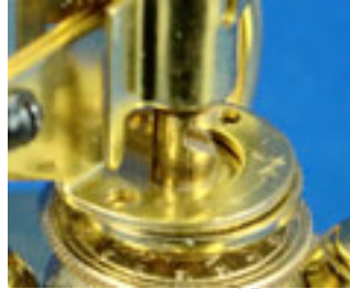
Pendulum anti-rotation device

The guard has two prongs which engage into the pendulum, preventing it from turning in transit as well as locking it normally.