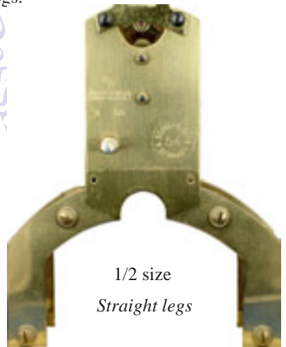
1/2 size Straight legs