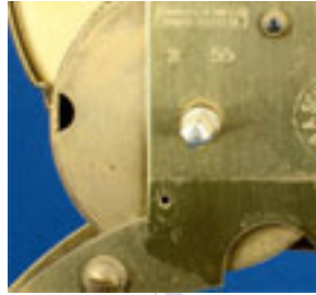
Giant mainspring barrel

Two shapes of legs exist: Straight-sided and curved. This is the straight sided leg model. Some backplates are marked RR, referring to Remington Rand of the USA.